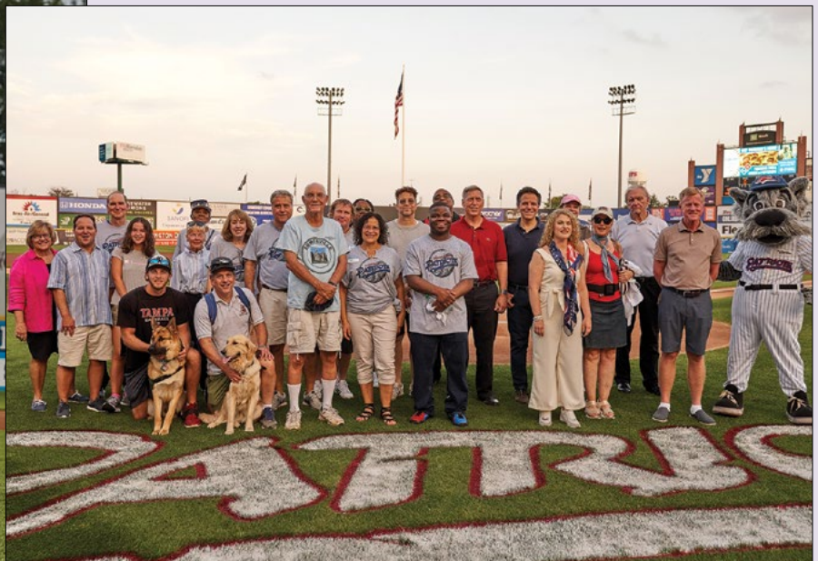
(continued on page 2)